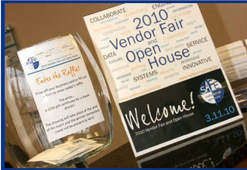
Photos of SAFE's 2010 Vendor Fair and Open House are on page 2 of this newsletter, as well as on our Facebook Fan Page.

The team at SAFE specializes in sales, service, and installation of commercial low voltage systems in the Pacific Northwest, Inland Northwest and Alaska. SAFE, along with our design-build partners, provides services to electrical and general contractors as well as the end user. Our customers have come to rely on our knowledgeable service and support.